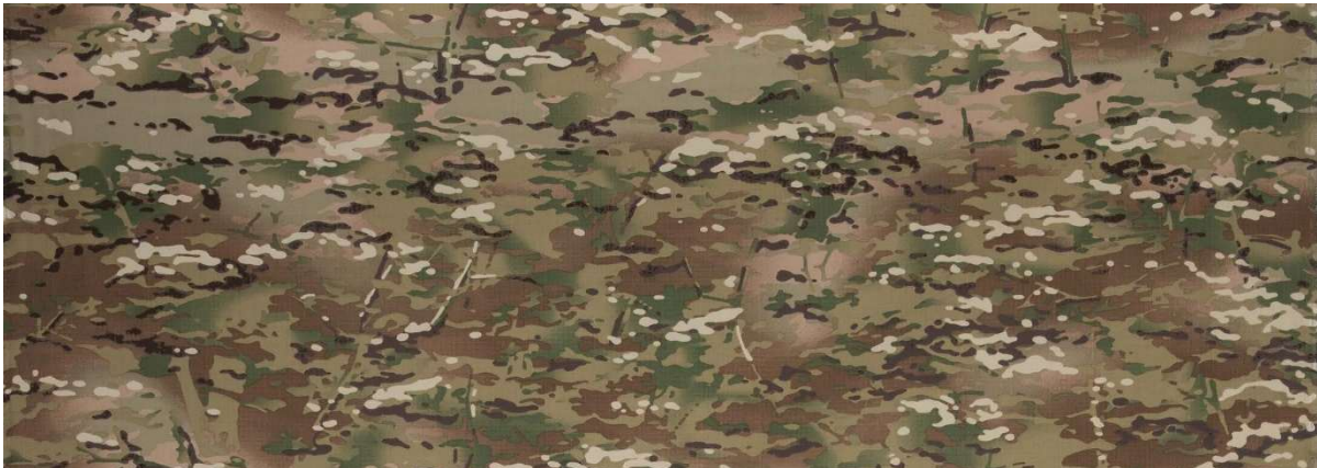
BLACK (VA 1-902-826)