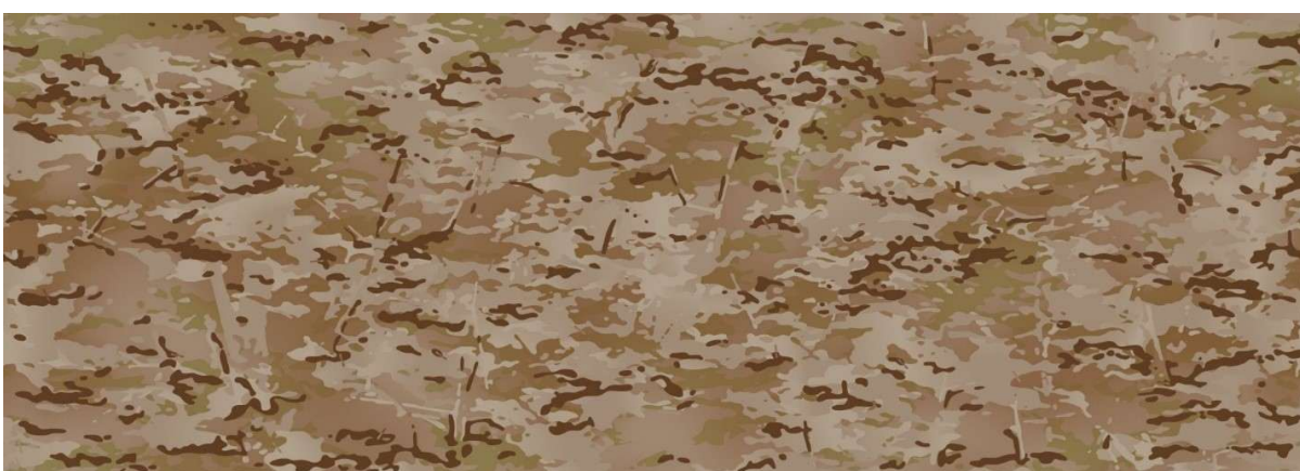
TROPIC (VA 1-902-832)